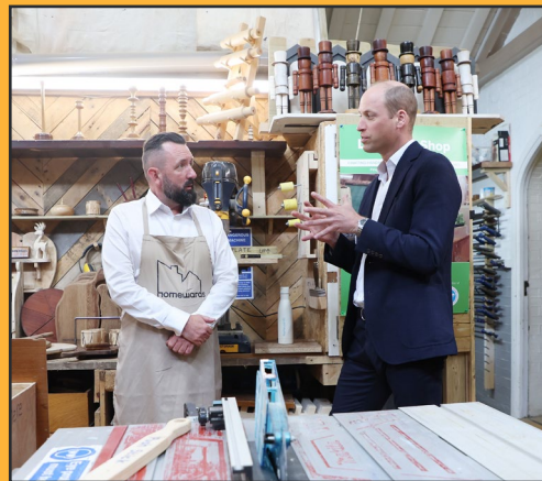
Prince William visits the Faithworks' Carpentry Workshop.

Through the Food Bank one of our Debt Advisors helped with benefit applications, and in partnership with Shelter, supported him with moving into his own home, where he could live with his daughter.